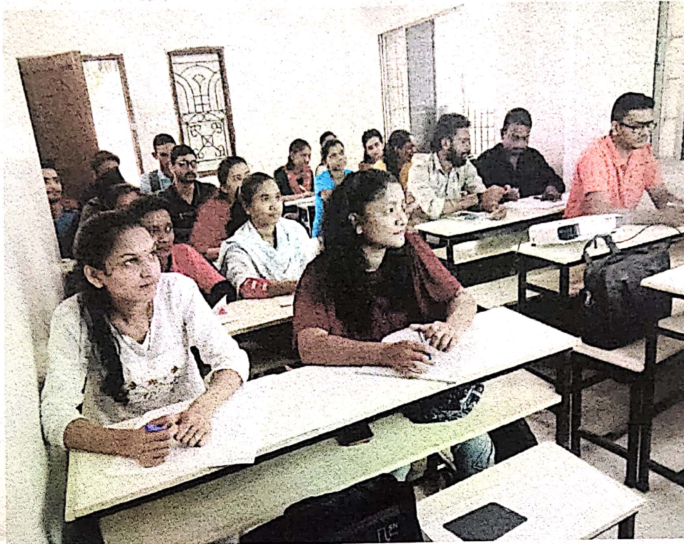
"MBA CET Workshops"