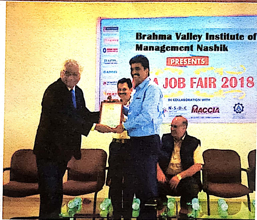
“Mega Job Fair for BVOIM”