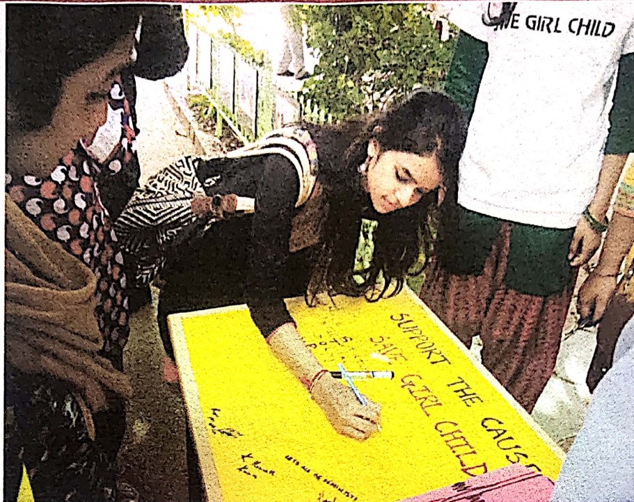
“Save Girl Child! – Programmes”