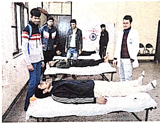
“Blood donation camp at BVIOM”