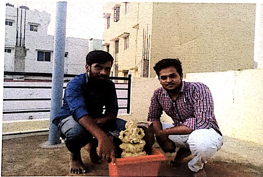
“GANESH VISARJAN Eco-friendly Ganesh Chaturthi”