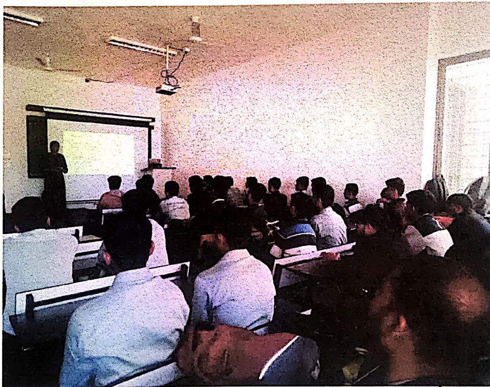
"Competitive exam guidance"