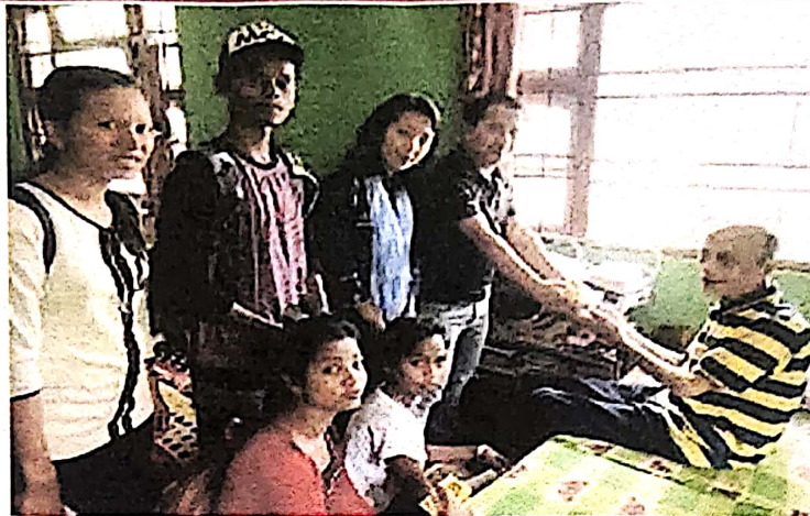
"Visit to Charitable Old Age Home with students & Faculty members"