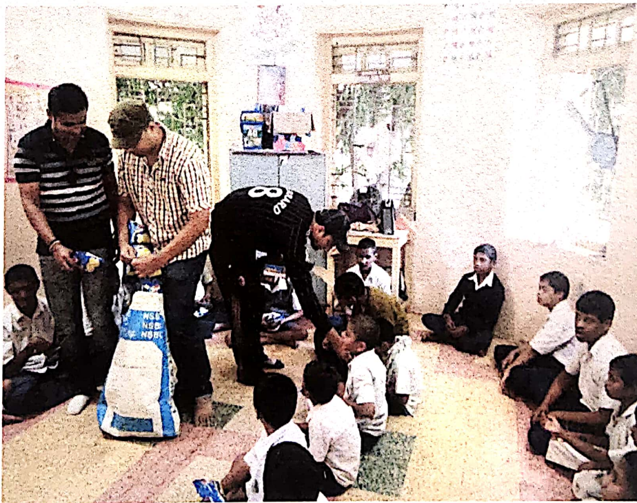
“Visit to Prabhodini Trust's Mai Lele School of Mentally”